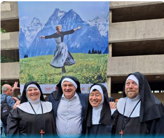
Sir Ed Davey MP, for Kingston and Surbiton, celebrating at New Malden

A big tuneup thanks to the Friends of New Malden for organising