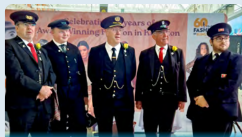
Volunteers in uniform from the Watercress line and SWR

September the month we've all been waiting for has finally arrived, marking the official 200th anniversary of the modern railway. It's been a month full of creativity, community spirit, and legacy projects across the network.