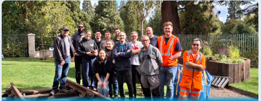
Volunteers from Network Rail and SWR planting and painting in the garden.

Set on disused land behind the station that leads directly into the cemetery, the garden has been lovingly created with the help of our contractors, volunteers from Network Rail and South Western Railway, and the unwavering support of the cemetery team. The space now offers a peaceful spot for reflection, complete with information boards about the historic Necropolis Railway. It will also in time provide a place for memorial plaques dedicated to railway colleagues who have died. The launch was a truly special occasion, with a blessing from Railway Chaplain Christopher Henley, a short performance from a new play 'A Train to Woking' by the Fleur de Lis Classical Theatre Company, and a fascinating historical walk led by railway historian John Clarke.