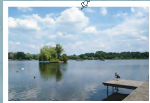
Picturesque Heath Pond

*Also runs Bank Holiday Monday 26 August